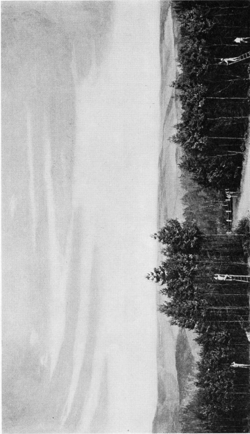
Fig. 2.—Model No. 7 in the Silvicultural Series showing artificial pruning of white pine to obtain clear lumber.