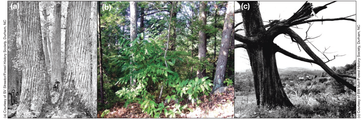
Figure 4. American chestnut. (a) Chestnut timber, Great Smoky Mountains of western North Carolina (circa 1910), a foundation species that was transformed in the mid-20th century to an understory shrub (b; small shrub in center) by the introduced pathogen Cryphonectria parasitica, which causes chestnut blight (c; chestnut in the Blue Ridge Plateau killed by the blight, circa 1946).

stream macroinvertebrates have life cycles closely synchronized to the dynamics of detrital decay, and this change in detrital quality undoubtedly affected the macroinvertebrate assemblage, although there are no data to support this supposition. Furthermore, slowly decomposing chestnut wood persists for decades in stream channels, altering channel structure and providing habitat for fish and invertebrates. For example, in an Appalachian headwater stream sampled in the late 1990s, Wallace et al. (2001) found that 24% of the large (> 10 cm diameter) woody debris still consisted of American chestnut that had died over 50 years earlier.