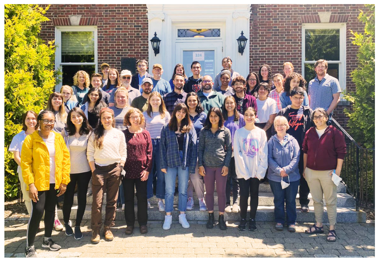
2022 Summer Research Program Students and Mentors