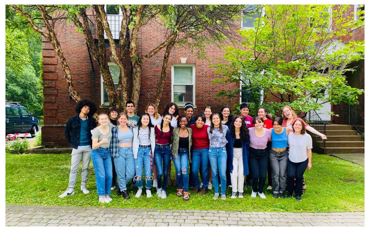
2022 Summer Research Program Students and Proctors