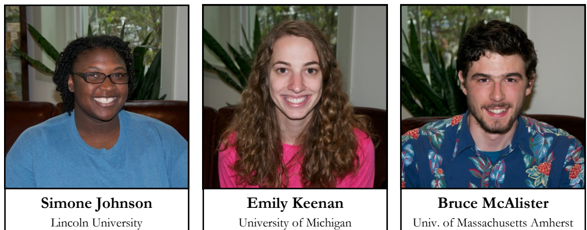
Univ. of Massachusetts Amherst