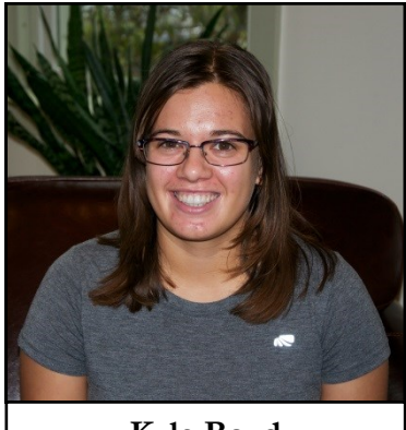
Kyle Boyd Smith College