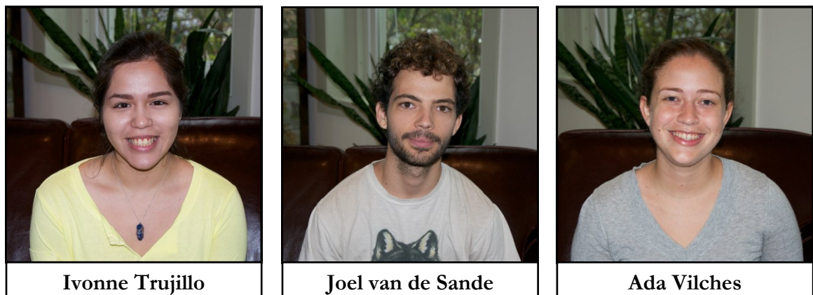
Univ. of Texas at Brownsville