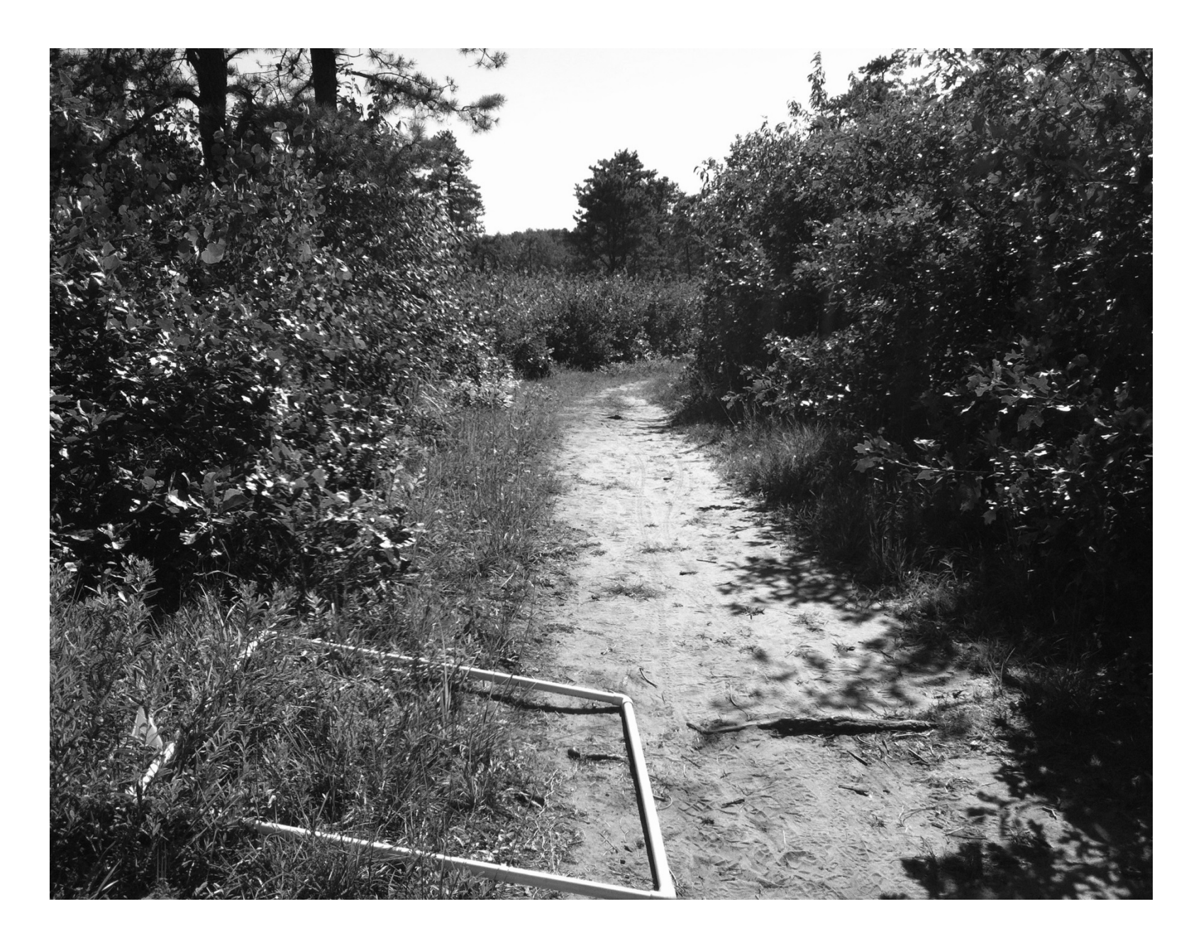
Photograph of the trail edge boundary