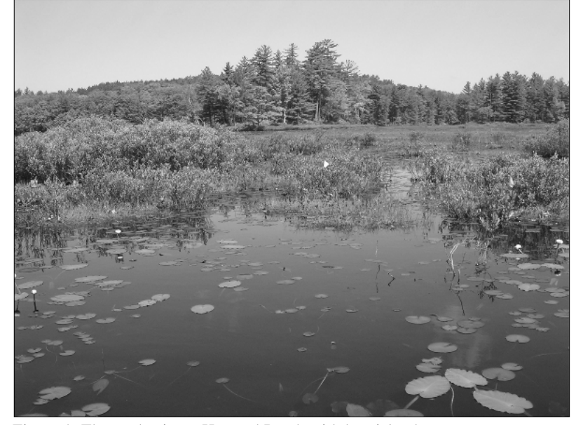
Figure 1. The study site at Harvard Pond, with bog islands.

Sarracenia purpurea is a carnivorous, perennial herb that grows in bogs and poor fens on the eastern coastal plain of the United States, through Atlantic Canada and across the northern mid-western United