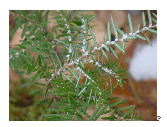
Woolly Adelgid Egg Sacs found on underside of needles

"The Hemlock Woolly Adelgid (HWA) is an invasive, aphid-like insect. It was first reported in the U.S. in Virginia in 1951. In New England, the insect attacks and--over a period of years--kills eastern hemlock trees. Millions of trees have been infested or killed from Georgia to southeastern Maine." Harvard Forest website: <a href="http://harvardforest.fas.harvard.edu/other-tags/hemlock-woolly-adelgid-hwa">http://harvardforest.fas.harvard.edu/other-tags/hemlock-woolly-adelgid-hwa</a>