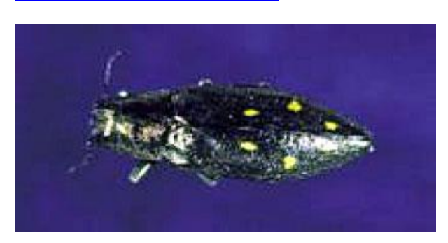
Adult Hemlock Borer, 10 mm long; width at the base of the wing cover is 3 mm

"The hemlock borer, Melanophila fulvoguttata (Harris), is a pest of eastern hemlock, Tsuga Canadensis , throughout its natural range. Although normally considered a secondary pest and seldom abundant, the borer can develop to outbreak conditions following wind-throw, drought, excessive stand openings, or attacks by other primary pests such as the hemlock woolly adelgid ( Adelges tsugae ) or hemlock loopers ( Lambdina spp.)." USDA: <a href="http://www.nrs.fs.fed.us/pubs/1041">http://www.nrs.fs.fed.us/pubs/1041</a>