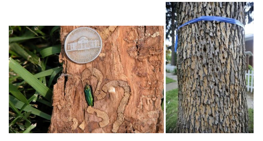
Adult E.A.B. are slender, elongate, and 7.5 to 13.5 mm long, bronze, golden, or reddish green overall, with metallic emerald green wing covers"

A beetle from Asia, Agrilus planipennis Fairmaire (Coleoptera: Buprestidae), was identified in July 2002 as the cause of widespread ash (Fraxinus spp.) tree decline and mortality in southeastern Michigan and Windsor, Ontario, Canada. Detected in recent years in New England. Larval feeding in the tissue between the bark and sapwood disrupts transport of nutrients and water in a tree, eventually causing branches and the entire tree to die. Tens of millions of ash trees in forest, rural, and urban areas have already been killed or are heavily infested by this pest. USDA: <a href="http://www.emeraldashborer.info/files/eab.pdf">http://www.emeraldashborer.info/files/eab.pdf</a>