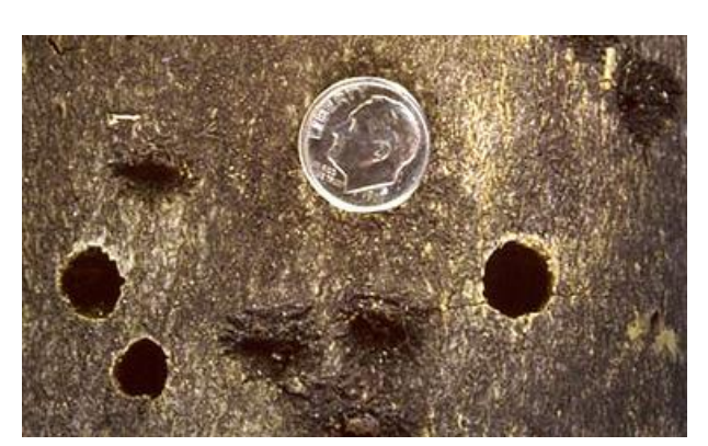
A.L.B. Exit holes on trunk