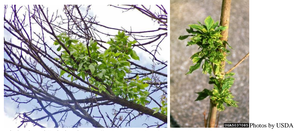
Die back and "witches brooms" characteristic of Ash Yellows disease

Ash yellows is a recently discovered disease that causes slow growth and decline of ash (Fraxinus) species. Ash yellows went undetected until the 1980s because its symptoms were not differentiated from those of decline caused by adverse environmental factors such as drought, shallow soils, flooding, or parasitism by opportunistic fungi. Current knowledge supports the theory that ash decline can result from various causes, and ash yellows can be, but is not always, a causal factor. USDA: <a href="http://www.ncrs.fs.fed.us/pubs/viewpub.asp?key=916">http://www.ncrs.fs.fed.us/pubs/viewpub.asp?key=916</a>