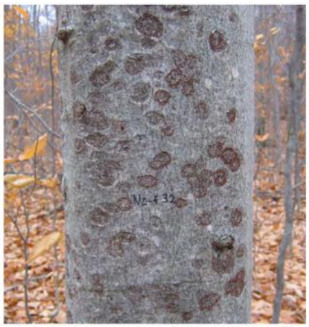
Figure 1. Cankers caused by Neonectria faginata on the stem of a

Beech bark disease (BBD) has been deforming and killing American beech ( Fagus grandifolia ) trees in the Eastern United States since the 1930s. A beech scale insect ( Cryptococcus fagisuga ) first attacks tree bark, creating a wound that provides an entryway for two different fungi ( Neonectria coccinea var. faginata and Neonectria galligena) to invade the tree. The fungus grows and kills the living tissue under the outer bark, resulting in cankers that can eventually girdle and kill a tree. Trees that survive may become disfigured." USDA: http://na.fs.fed.us/fhp/bbd/beech-bark-disease-pest-alert_120329.pdf