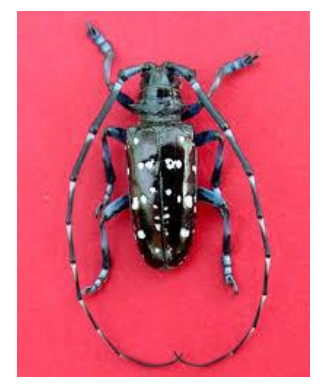
Adult Male A.L.B., 1 inch to 1.5 inches in length with six legs and a shiny black body with random white spots

"The Asian long horned beetle (ALB, Anoplophora glabripennis ) is a destructive wood-boring pest of maple and other hardwoods. ALB was first discovered on several hardwood trees in the United States in Brooklyn, New York, in August 1996. ALB is believed to have been introduced into the United States from wood pallets and other wood packing material accompanying cargo shipments from Asia. ALB was later detected in Chicago, Illinois, in July 1998. The Secretary of Agriculture declared an emergency in order to combat the infestation with regulatory and control actions. In October 2002, the beetle was found in Hudson County, New Jersey, and then in Middlesex and Union Counties, New Jersey, in August 2004. In August 2008, ALB was discovered in Worcester County, Massachusetts, and in July 2010, ALB was found in Suffolk County, Massachusetts." USDA website: <a href="http://www.aphis.usda.gov/wps/portal/aphis/ourfocus/importexport?1dmy&urile=wcm%3apath%3a%2Faphis_content_library%2Fsa_our_focus%2Fsa_plant_health%2Fsa_domestic_pests_and_diseases%2Fsa_pests_and_diseases%2Fsa_insects%2Fsa_alb%2Fct_asian_longhorned_beetle</a>