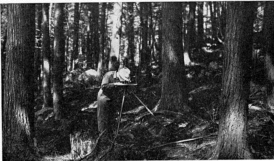
USING A PLANE TABLE IN THE HARVARD FOREST

To most of the fans the seven-point lead looked big enough to buy the victory, but