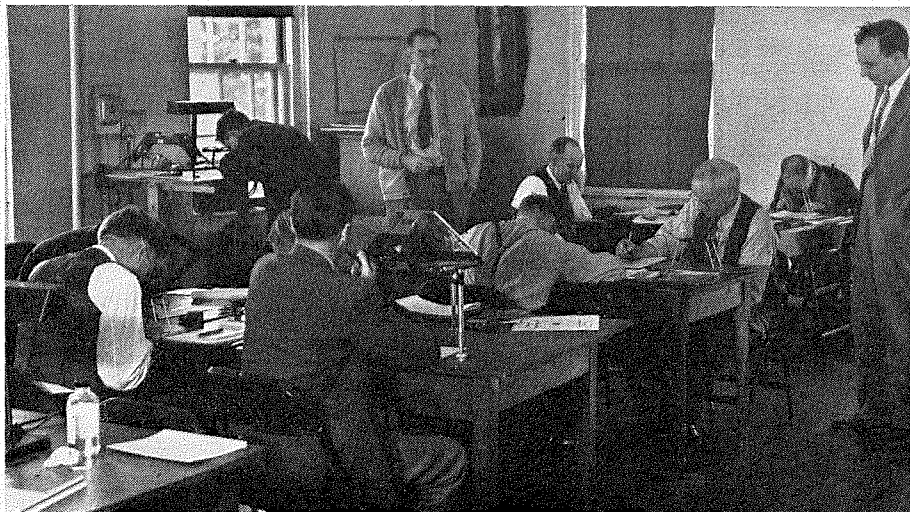
THE CLASS IN AERIAL FOREST PHOTOGRAPHY

BUT TODAY, with the development of photogrammetry (the process of mapping directly from aerial photographs) and aerial photointerpretation, it is obvious that in the future the forester's work is going to be based largely on aerial photographs. Their value, already demonstrated, is being sharply defined by the work at Petersham; and their usefulness, which depended formerly on access to one of the very few highly complicated photogrammetric instruments in existence, is now made readily available by two simple instruments which permit the forester to transfer data from photographs, viewed stereoscopically, directly on to