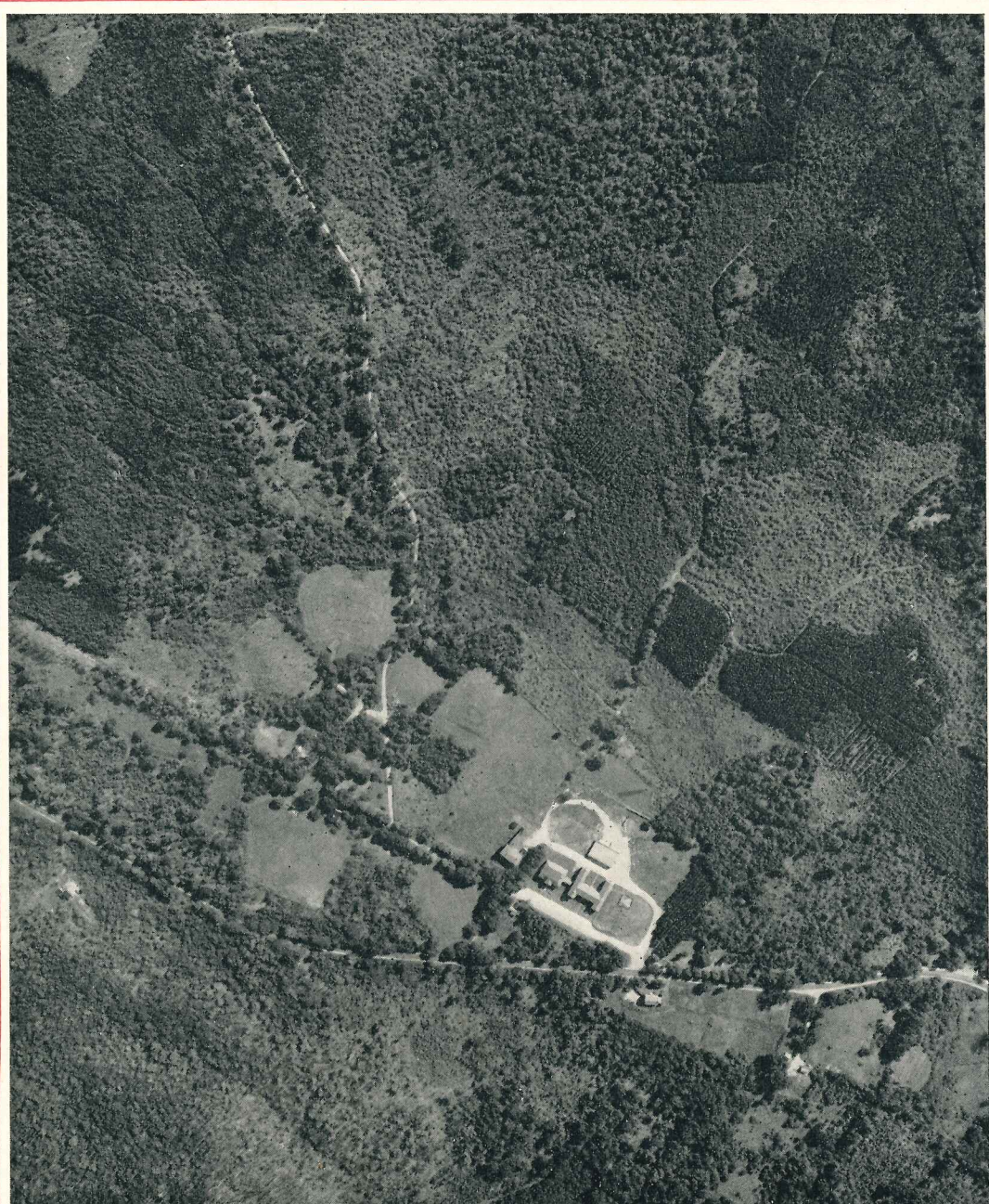
Harvard Forest: 7-5-44; 9:20 E.W.T.; Scale 1:6100