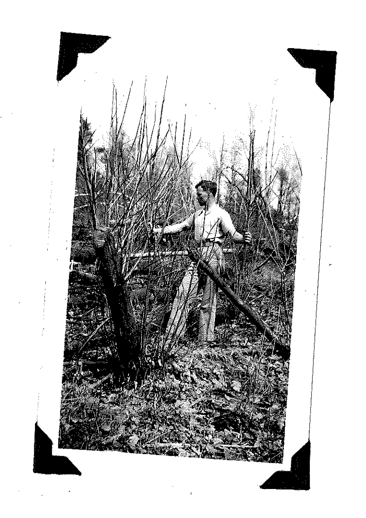
Fig. 5. High hardwood stump and bent over advance growth with stem suckers along the boles and vigor-ous sprouting at the root collars.