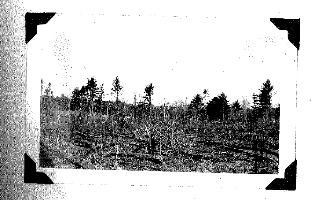
Fig. 3. Hurricane damaged "Old Field" Pine stand showing amount of unmerchant— able material left after logging. Note background of windfirm conifers and hard— woods along the border of the stand. These will serve as a source of seed.