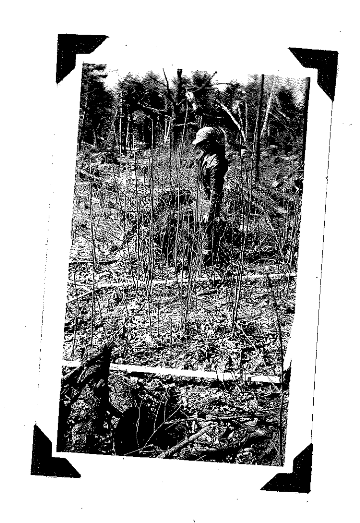
Fig. 6. A volunteer stand at end of second growing season showing fast-growing White Ash sprouts with many potentially valuable stems present.