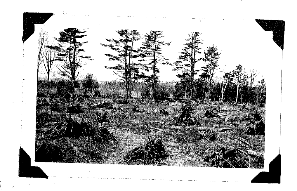
Fig. 8. A white pine blowdown cleaned up by logging and subsequent slash disposal. The exposed mineral soil caused by uprooting furnishes ideal seed beds.