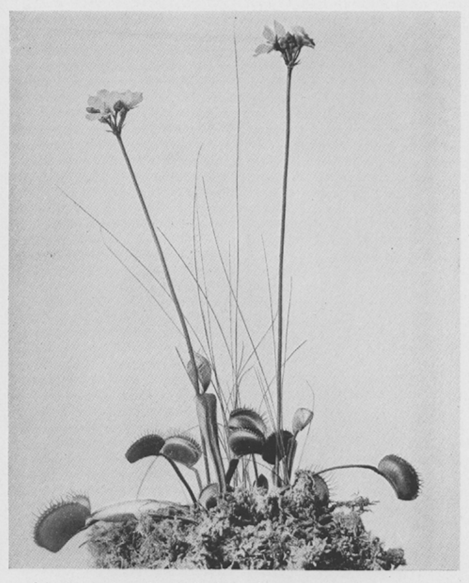
Only when the slender flower stalk raises its cluster of modest white flowers above the level of the leaves, is the discovery of Dionxa always possible without prolonged search

tribution is strictly localized, for it seems to be very particular in the selection of its growing place.