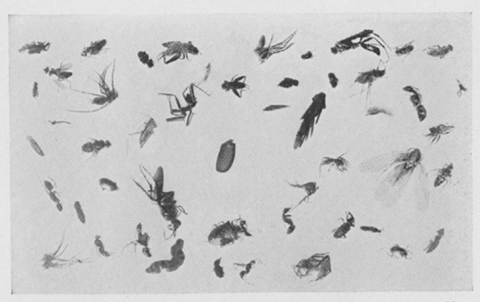
The captures of fifty mature leaves of Dionxa consisted of Hymenoptera (wasps and large ants), 10; Diptera (flies), 9; arachnids (spiders), 9 (one with an egg sack); Coleoptera (beetles), 9 (each distinct as to species); Orthoptera (grasshoppers, locusts, roaches), 7; Hemiptera (predacious bugs and leaf hoppers), 4; Lepidoptera (caterpillars), 2. The average length of the fifty victims was 8.6 mm., or about one third of an inch

posing that the leaves never opened a second time. . . If you do visit the proper district I shd be very much obliged if you wd open a dozen oldish leaves to see what sized insects they capture. I am aware that a very minute insect wd start the leaf, but I suspect that they wd generally escape through the apertures at the bases of the spikes before they completely interlocked."