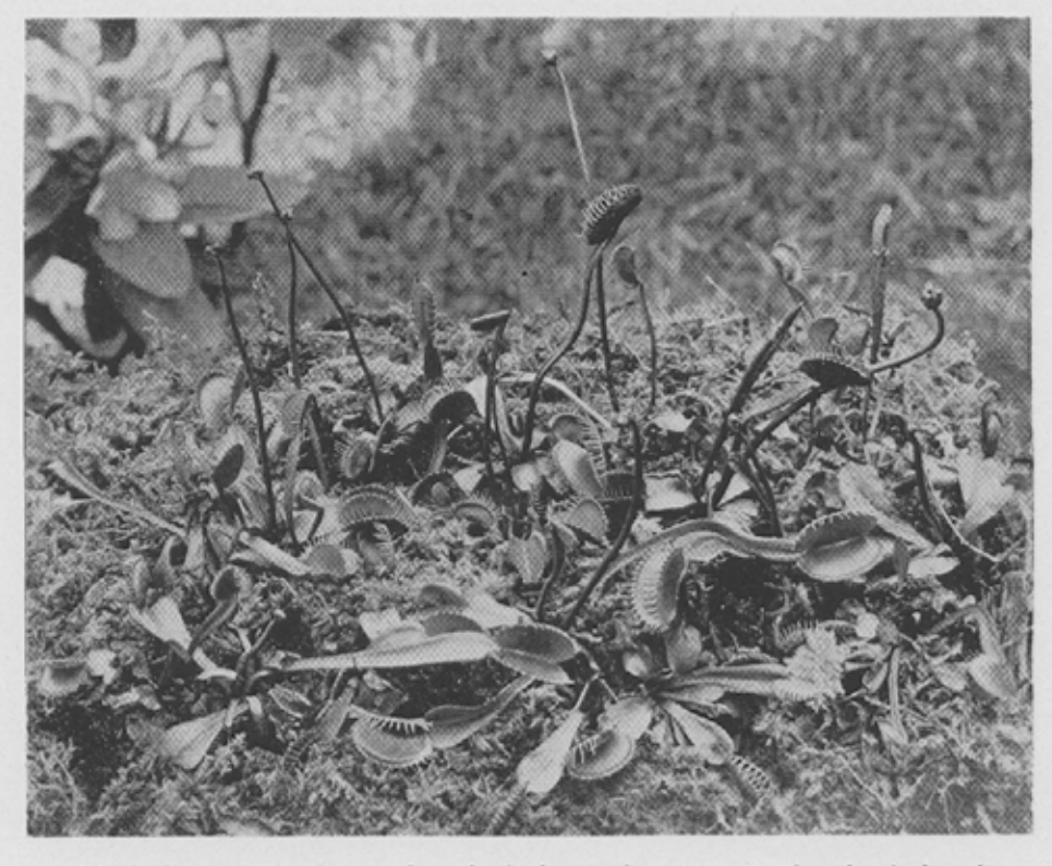
Dionæa is not a conspicuous plant, for its leaves rise, at most, only a few inches above the sand, where they are often half-hidden by other herbage

Dionæa muscipula, Venus's-flytrap, belongs to the same plant family as the more familiar Drosera, the sundews; but while some species of Drosera are almost world-wide in their distribution, Dionæa, represented by its single species muscipula, is confined, if one excepts hothouse specimens, to a narrow strip of about fifty miles along the coast of North and South Carolina; and even within these limits its dis-