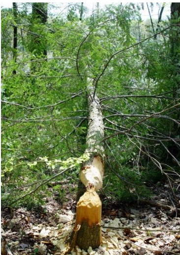
Beaver cut hemlock