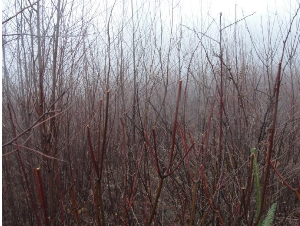
Upper Left: Moose browse (rough up to 3m)