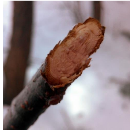
Porcupine Browse (hemlock)