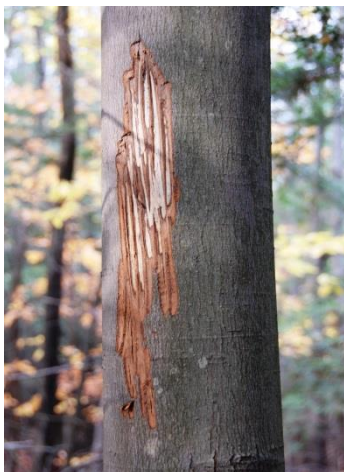
Moose Bark Scraping