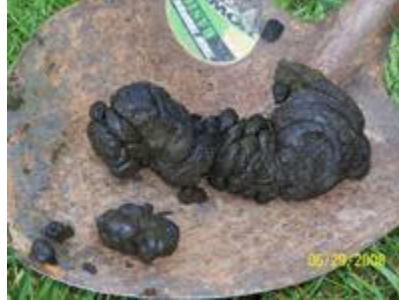
Right: Bear Scat