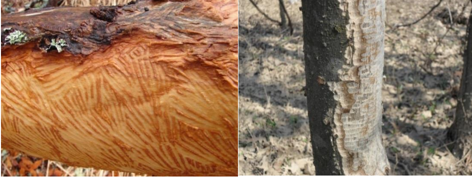
Porcupine Bark Scraping