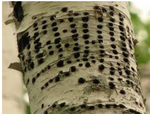
Right: Sapsucker Holes