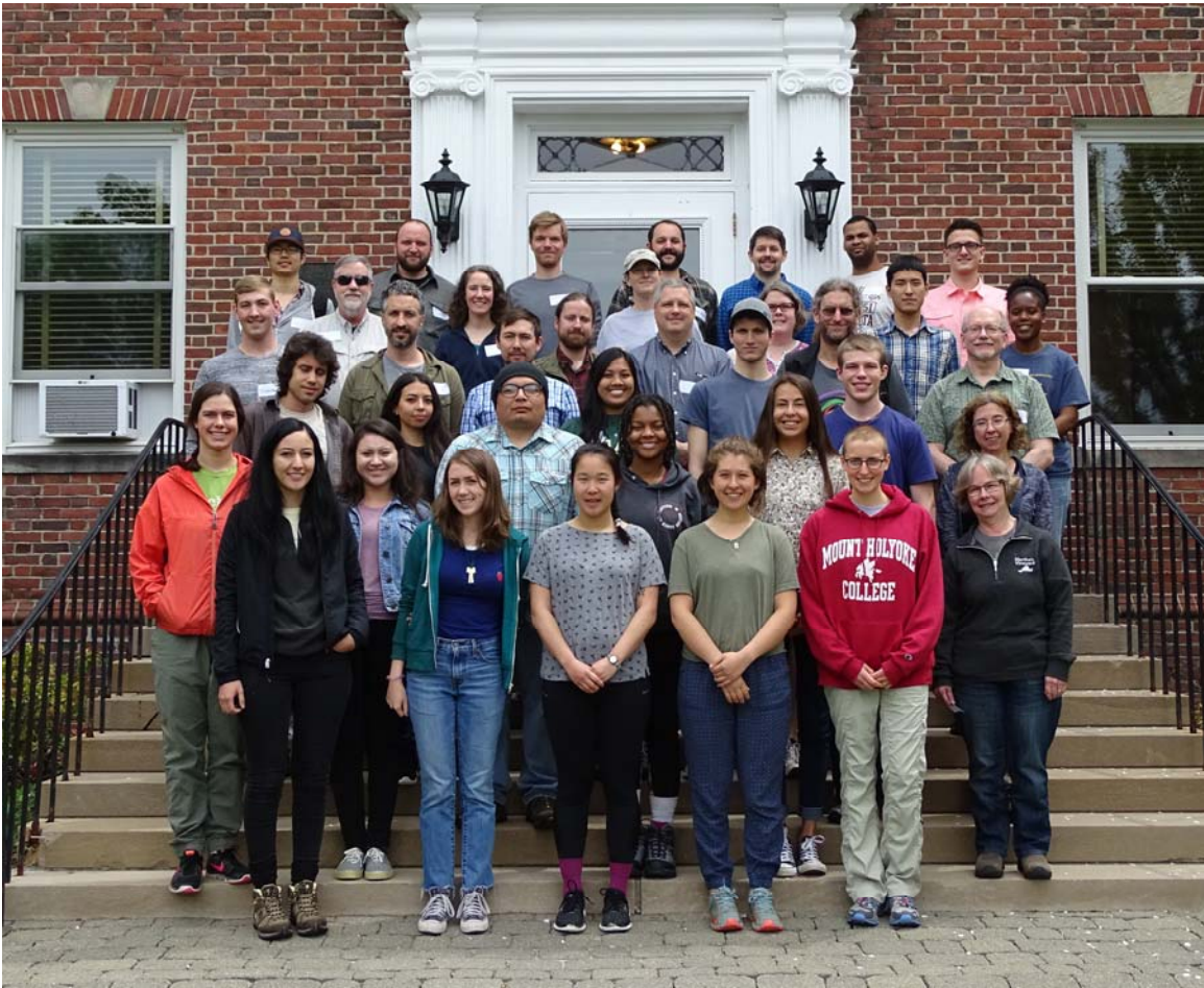
2017 Summer Research Program Students & Mentors