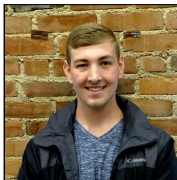
States Labrum Columbia State Community College