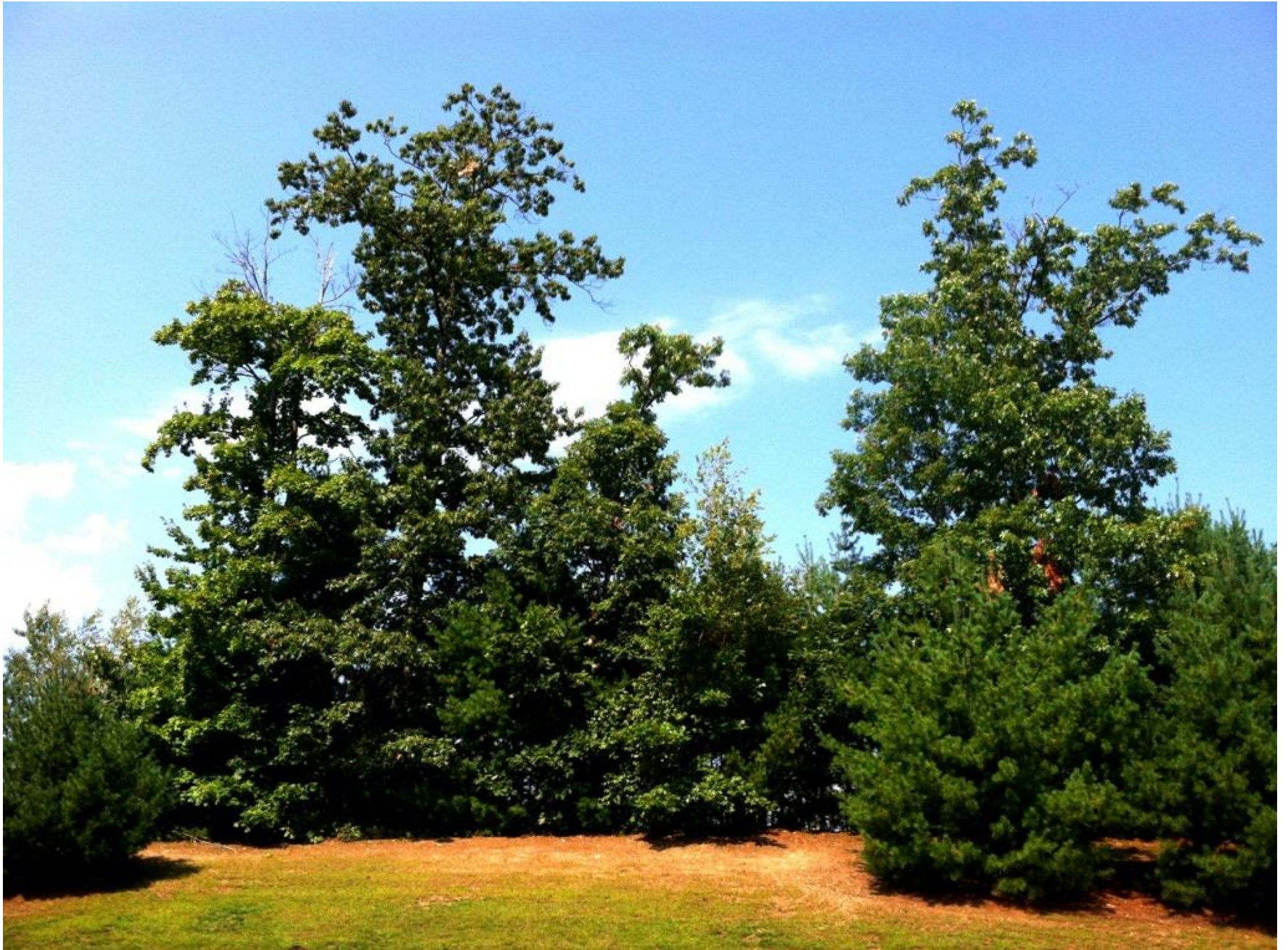
BLG Late Summer landscape study site 5-9