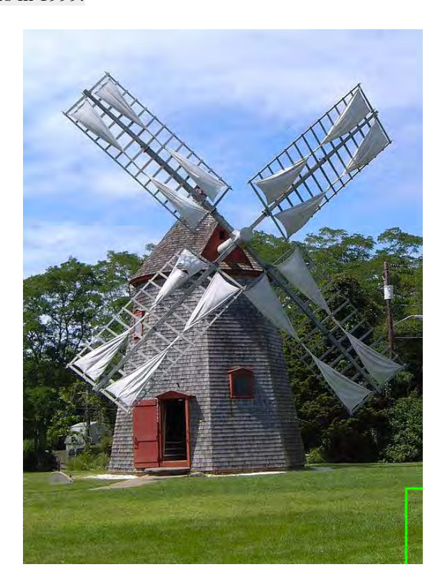
In 1854, Daniel Halladay constructed the first of what is considered the American windmill in Connecticut. Halladay's design was much simpler than the Dutch mills, and it was much less

The Eastham Windmill, located in Eastham, Massachusetts, is the oldest windmill on Cape Cod. It was constructed by Eastham resident Thomas Paine in Plymouth in 1680. It was first moved to nearby Truro in 1770, then finally to Eastham in 1793. In 1808 the windmill was moved to its present location, near the Eastham Town Hall and the Eastham Public Library. Eastham Windmill, as part of the Eastham Center Historic District, was added to the National Register of Historic Places in 1999.