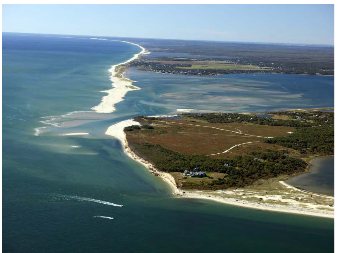
Figure 1C. Norton Point Inlet Oct 13, 2012 Looking West showing Schifter property, TTOR property, inlet and Katama Beach