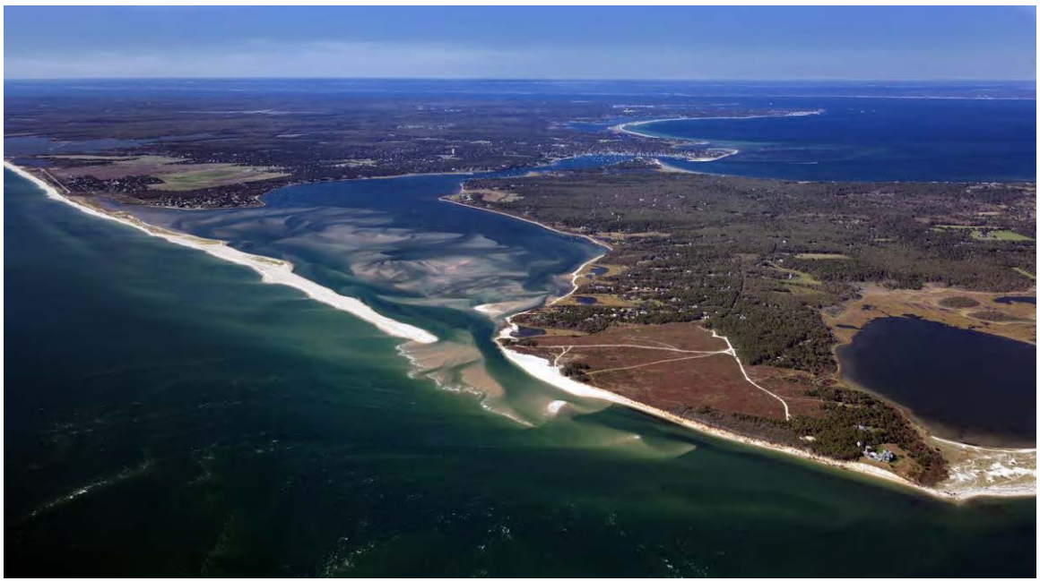
Figure 1A. Norton Point Inlet Oct 13, 2012 Looking Northwest showing Katama Bay, Katama Beach, and Wasque