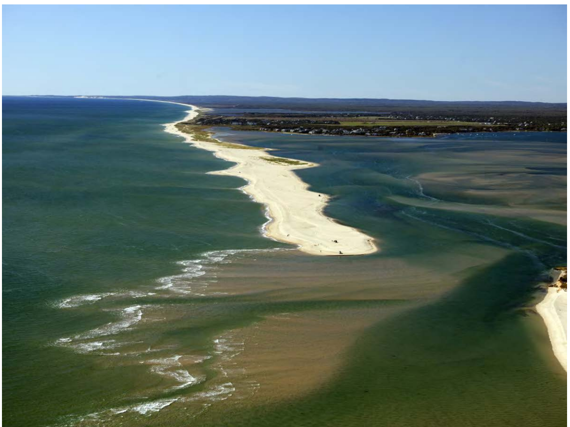
Figure 1B. Norton Point Inlet Oct 13, 2012 Looking West showing inlet, channel margin linear bar and Katama Beach.