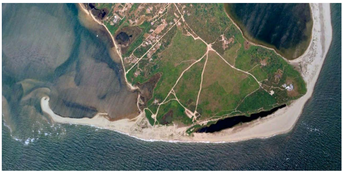
Figure 3. July, 2008 air photo showing protective beach along Wasque and the Swan Pond, which is a relict of an ebb channel from an earlier tidal inlet.