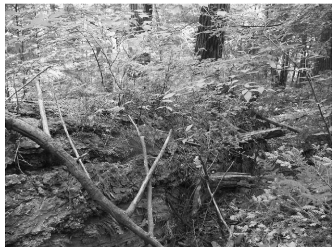
Fig. 3. Downed hemlock log within an old-growth hemlock stand on Mt. Everett, MA. Note the abundant Tsuga canadensis and Betula alleghaniensis seedlings.

Although there were compositional similarities in the seedling and sapling layers between old-growth and second-growth hemlock stands (Table 4), densities of seedlings and saplings were much greater in old-growth stands. The factors described as influencing the patterns for understory herb and shrub abundance between old-growth and second-growth stands (e.g., greater diversity of microhabitats and resource availability in old-growth stands) also likely contributed to the patterns in seedling and sapling densities. In particular, several studies have demonstrated the importance of decaying logs on the forest floor as microhabitats for certain tree species (Christy and Mack, 1984; Harmon and Franklin, 1989; Beach and Halpern, 2001), including T. canadensis and B. alleghaniensis (Mladenoff and Stearns, 1993; Corinth, 1995; McGee, 2001; Marx and Walters, 2008). In this study, the abundance of highly decayed downed wood (decay classes III and IV combined, after Fraver et al., 2002) was almost five times greater in old-growth forests compared to second-growth forests (56.2 m 3 /ha versus 11.6 m 3 /ha). While we did not specifically sample downed logs for seedling and sapling abundance, seedlings