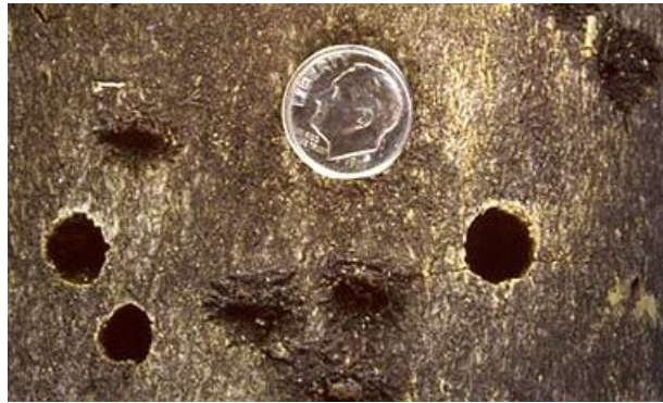
A.L.B. Exit holes on trunk