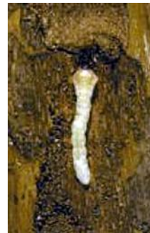
Mature H.B. Larva is translucent white, 2.5 cm long