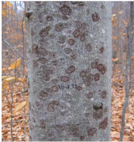
Figure 1. Cankers caused by Neonectria faginata on the stem of a beech tree.

Beech bark disease (BBD) has been deforming and killing American beech ( Fagus grandifolia ) trees in the Eastern United States since the 1930s. A beech scale insect ( Cryptococcus fagisuga ) first attacks tree bark, creating a wound that provides an entryway for two different fungi ( Neonectria coccinea var. faginata and Neonectria galligena ) to invade the tree. The fungus grows and kills the living tissue under the outer bark, resulting in cankers that can eventually girdle and kill a tree. Trees that survive may become disfigured.” USDA: http://na.fs.fed.us/fhp/bbd/beechn-bark-disease-pest-alert_120329.pdf