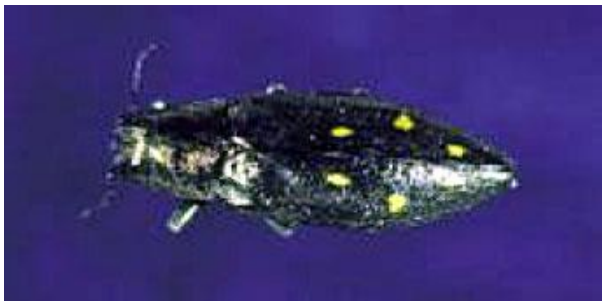
Adult Hemlock Borer, 10 mm long; width at the base of the wing cover is 3 mm

“The hemlock borer, Melanophila fulvoguttata (Harris), is a pest of eastern hemlock, Tsuga Canadensis , throughout its natural range. Although normally considered a secondary pest and seldom abundant, the borer can develop to outbreak conditions following wind-throw, drought, excessive stand openings, or attacks by other primary pests such as the hemlock woolly adelgid ( Adelges tsugae ) or hemlock loopers ( Lambdina spp.).” USDA: http://www.nrs.fs.fed.us/pubs/1041