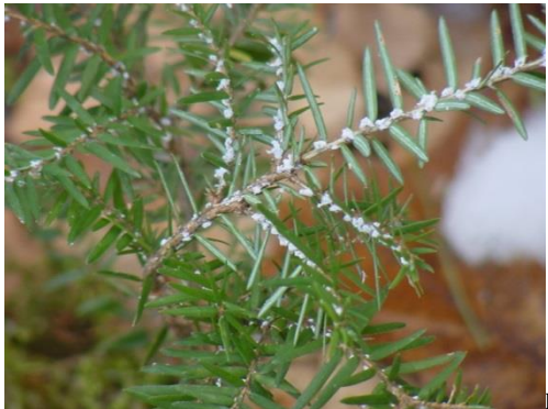
Woolly Adelgid Egg Sacs found on underside of needles

http://harvardforest.fas.harvard.edu/other-tags/hemlock-woolly-adelgid-hwa