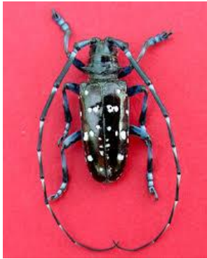
Adult Male A.L.B., 1 inch to 1.5 inches in length with six legs and a shiny black body with random white spots

“The Asian long horned beetle (ALB, Anoplophora glabripennis ) is a destructive wood-boring pest of maple and other hardwoods. ALB was first discovered on several hardwood trees in the United States in Brooklyn, New York, in August 1996. ALB is believed to have been introduced into the United States from wood pallets and other wood packing material accompanying cargo shipments from Asia. ALB was later detected in Chicago, Illinois, in July 1998. The Secretary of Agriculture declared an emergency in order to combat the infestation with regulatory and control actions. In October 2002, the beetle was found in Hudson County, New Jersey, and then in Middlesex and Union Counties, New Jersey, in August 2004. In August 2008, ALB was discovered in Worcester County, Massachusetts, and in July 2010, ALB was found in Suffolk County, Massachusetts.” USDA website: http://www.aphis.usda.gov/wps/portal/aphis/ourfocus/importexport?1dmy&urile=wcm%3apath%3a%2Faphis_content_library%2Fsa_our_focus%2Fsa_plant_health%2Fsa_domestic_pests_and_diseases%2Fsa_pests_and_diseases%2Fsa_insects%2Fsa_alb%2Fct_asian_longhorned_beetle